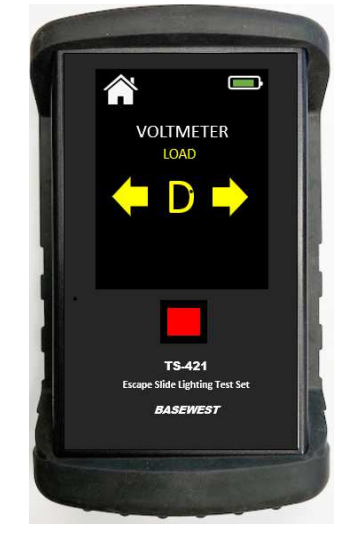
Select Voltmeter Mode