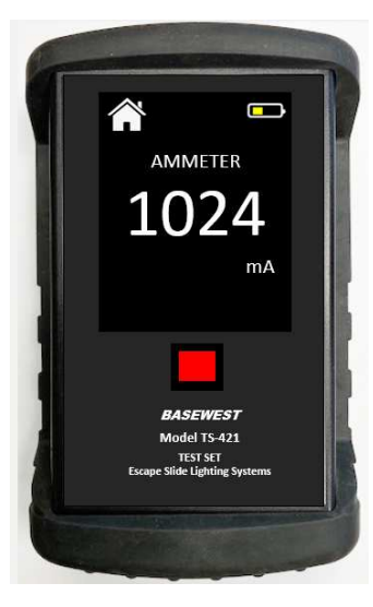
Select Ammeter Mode