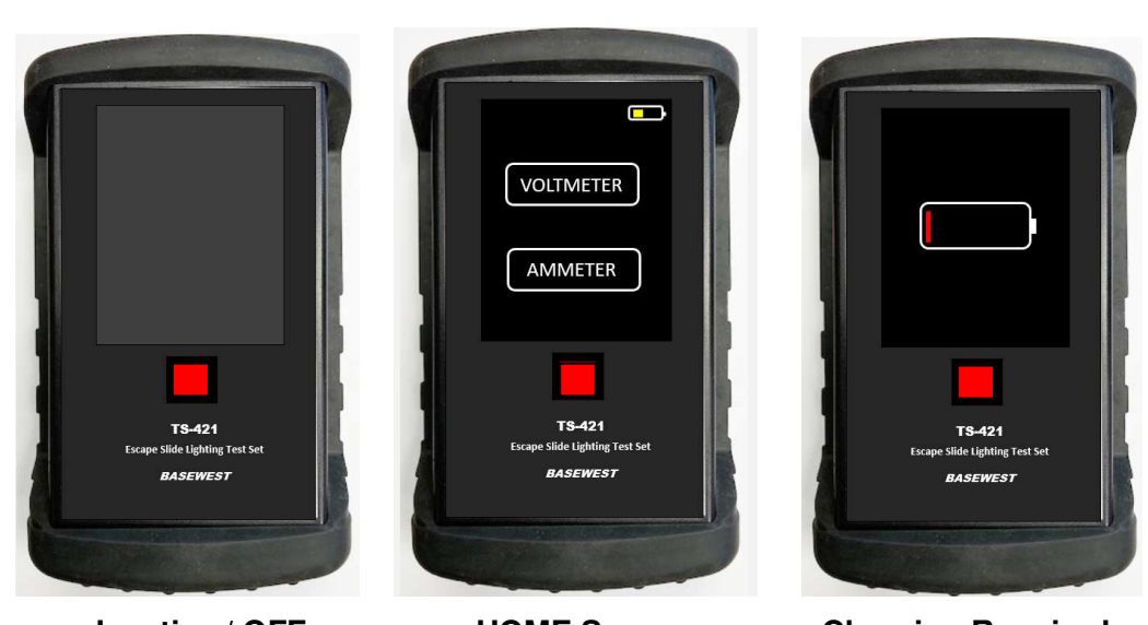
Inactive / OFF

The TS-421 is OFF when the Touchscreen is dark and the RED button is not illuminated. The test set is turned ON by pressing the RED button. The HOME screen appears with Voltmeter or Ammeter test selection options, shown center, below.