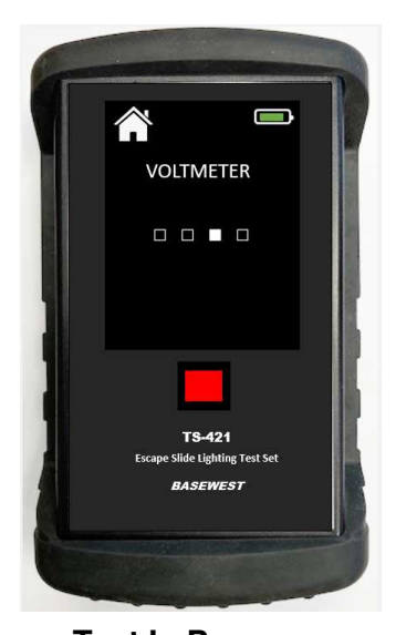
Test In Process