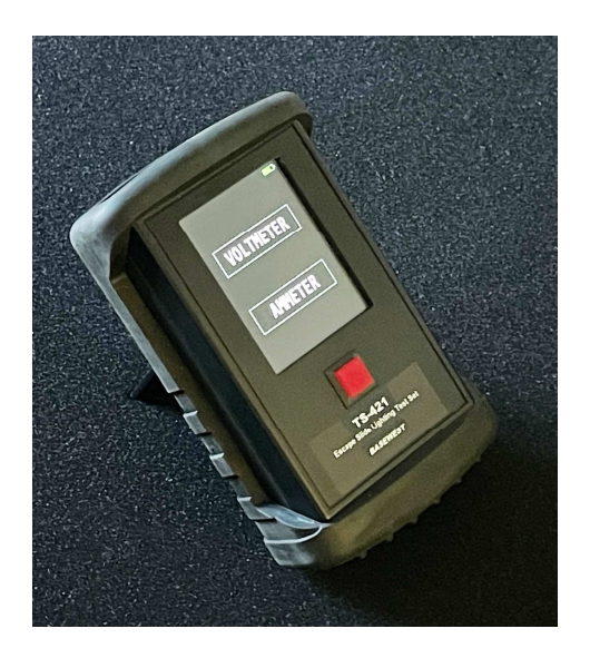
TS-421 Test Set (Home Screen Shown)

The Model TS-421 test set is a rechargeable, handheld instrument designed for testing airline escape slide lighting systems, light harnesses and batteries. The test set includes a voltmeter and ammeter with touchscreen operation, a built-in rechargeable battery, a 5VDC power supply and a removable protective cover. The unit is provided with a 120/220 VAC charger and adapter for both domestic and international use. The TS-421 replaces the original TS-420 test set which is inactive for procurement and duplicates the functions of the Astronics TU-14 test set.