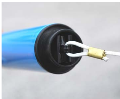
Figure 3 - Installation of Activation Switch Plug

Install the Model 700-series battery pack in accordance with escape slide manufacturer's component maintenance manual procedures. Secure the end of the activation lanyard to the escape slide structure and route it to the battery pack in accordance with the escape slide manufacturer's CMM. Fully install the switch plug (located on the end of the activation lanyard) into the clip in the switch end of the battery pack per Figure 3. Do not safety-tie or otherwise obstruct free release of the switch plug from its retention clip.