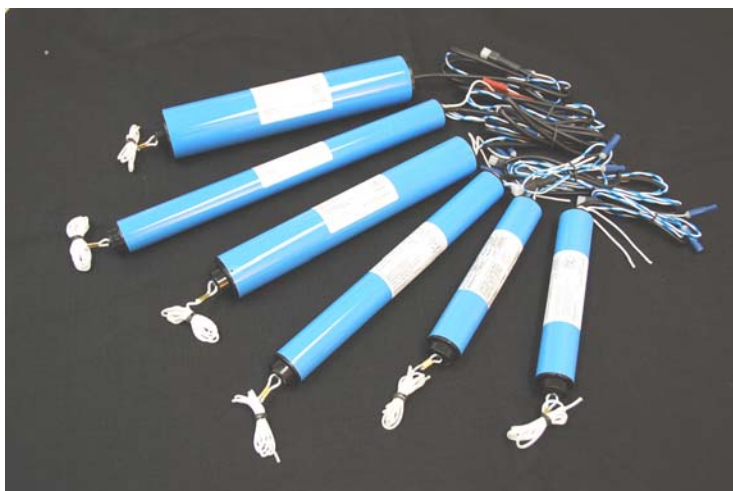
Figure 1 - Typical Model 700-Series Batteries